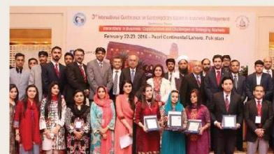
Group Photograph of ICIBM participants and organisers