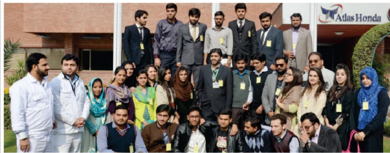
Group photograph of students and staff during their visit of Atlas Honda Pvt. Ltd.

The Directorate of Promotion & Placements has arranged a number of industrial trips for the students of UCP, following the objectives of experiential learning. Few of these visits include UCP Business School students visit to Atlas Honda Pvt. Ltd. and Faculty of Engineering students visited PECO industry,