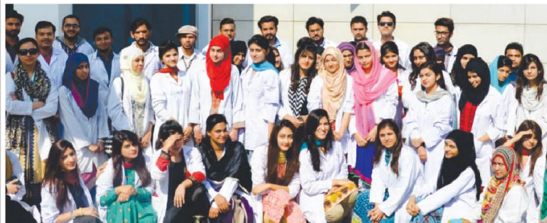
Group Photograph of the students and staff during their visit of CCL Pharmaceuticals.

After the visits, the positive feedback from the students about such experiential learning initiatives, further strengthens the approach towards strong industry academia linkages.