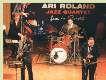
US Band performing at the event

Student Council Office, UCP, in collaboration with US Consulate organized a concert on 19th February, 2016 at UCP Auditorium.