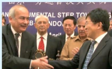
Pro-Rector UCP and representative of Qingdao Hengxing University exchanging MoU documents signed at Punjab-Shandong Business Seminar attended by Chief Minister of Punjab and Vice Governor Shandong Province of China

Between University of Central Punjab & Qingdao Hengxing University, China