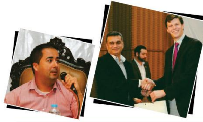
US universities representatives during their visit to UCP