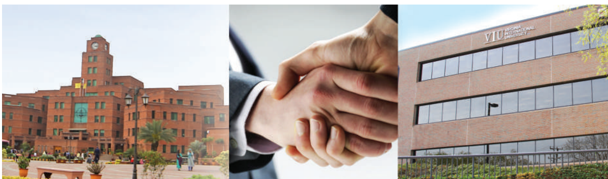
MOU Signed between University of Central Punjab and Virginia International University

An MOU was signed between University of Central Punjab and Virginia International University, USA. The purpose of the MOU was to facilitate all exchanges and cooperative initiatives between the two institutes. And according to the MOU,