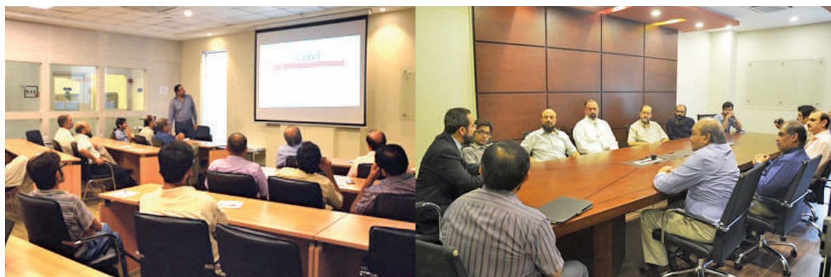
Faculty Memebrs from UCP Engineering and IT Department at Zong Head Office