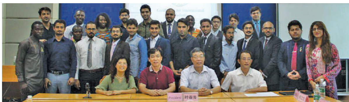
UCP Students in China with President Guangdong Ocean University

An MOU was signed between Guangdong Ocean University and the University of Central Punjab, subsequent to which 6 UCP graduates of BS Mechanical Engineering were sent to Guangdong Ocean University for their 3 years MS Degree on