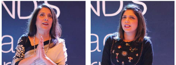
Sameena Peerzada and Hadiqa Kiani sharing their success stories

Pond's TEDx in collaboration with University of Central Punjab, organized a motivational interactive session in UCP. The session was based on the success journeys of the two most renowned and powerful personalities Ms Sameena Peerzada and Ms Hadiqa Kiani. The speakers mesmerized the audience by sharing their intriguing life challenges and their strength to overcome those hurdles to reach the prestigious and iconic positions. The session was pivoted on the everyday challenges that women face and the transition of women role in contributing to our economy and overall image of the country, from past to recent times. Ms. Hadiqa Kiani on the request of students performed song of her new album which was applauded by her immense fan following.