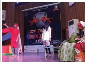
Dramatics club demonstrating their acting skills