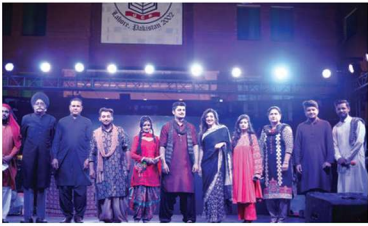
Students celebrating the vibrant customs and traditions of Pakistan