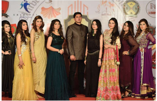
Students while posing on Welcome Eve