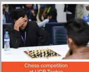
Chess competition at UCP Taakra