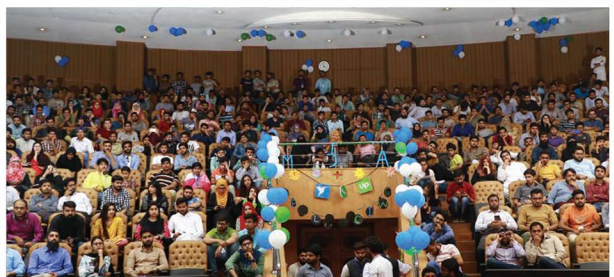
Participants of different universities at Freelancers Meetup