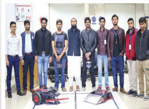
Participants of 'UCP Taakra' at the Robotics competition

University of Central Punjab, is known for its meritorious and scrupulous co and extra-curricular activities. With an aim of promoting healthy competition, UCP organized its first ever edition of mega event - UCP Taakra'18, an intervarsity competition. More than 80 institutions participated from all over Pakistan to compete in 38 varied competitions including Sports, Debates, Business Idea, Case Study, Cooking, Performing Arts, Music, Photography, Law Moot, Gaming, Fine Arts, Movie Making and Robotics and they were judged by noted personalities. Cash Prizes of More than PKR. 1,500,000/- were awarded to Winners and Runner Ups. The event also comprised of Social Nights which included Qawali Night, DJ Night, Fashion Show, Concert and a magnificent Prize Distribution Ceremony.