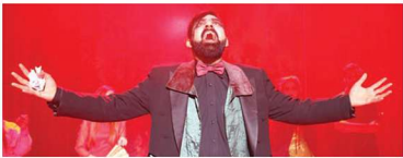
UCP Student performing as "Lucifer" in Dante's Inferno

UCP Literary Society in collaboration with the English Department staged its 3rd Annual English Play "Inferno". The lyrical play was an adaptation of Dante's Inferno portraying Lucifer, ruling the hell, along with the seven deadly sins. The play was a big hit and audience gave a standing ovation to the excellent show.