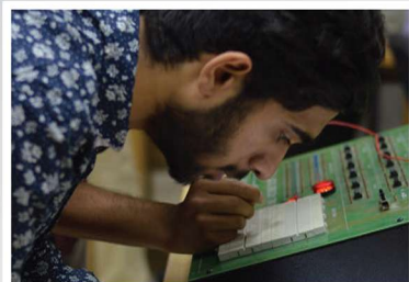
Students working on engineering projects during the Olympiad

The two vibrant engineering societies of UCP, Society of Electronics and Telecommunication (SET) and Society of Mechanical Engineers (SME), organized the 5 th Engineering Olympiad' 17.