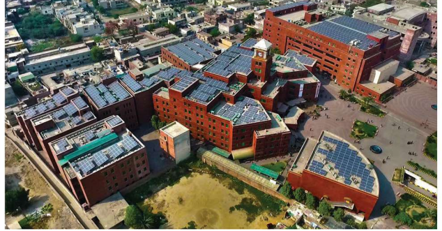
An aerial view of UCP 0.5 MW grid-tied solar plant.

In current scenario, the renewable energy has become a need for the future of energy independence in Pakistan. In the same regard University of Central Punjab, for self-consumption and to put an end to energy guzzling, installed one of Pakistan's largest Grid - Tied Solar Power Plant in the Education Sector.