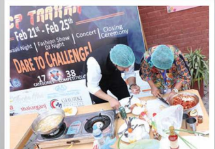
Cooking competition by Nisa society