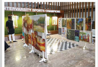
Display of artwork by Takhleeq society at UCP Taakra