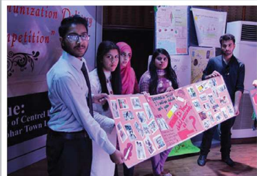
Poster depicting the role of pharmacists in immunization delivery prepared by students of Pharm.D

A one-day seminar on "Pharmacist Role in Immunization Delivery" followed by a poster competition was organized by UCP Health Club & Faculty of Pharmacy.