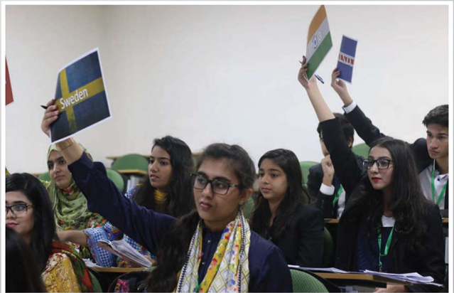
Participants during an ongoing session on "Reshaping generations through Diplomacy."