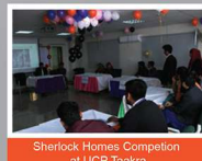
Sherlock Holmes Competition at UCP Taakra