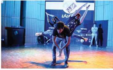
Dramatics club demonstrating their dance skills

UCP Dramatics Club hosted an Inter-University competition Funkariyan' 17. Twenty institutes from all over Pakistan participated in this mega fun-filled creative event. The purpose of the event was to provide a platform for talented amateurs to showcase their latent skills along with promoting conducive culture.