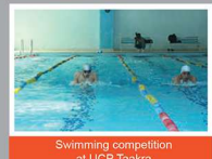
Swimming competition at UCP Taakra