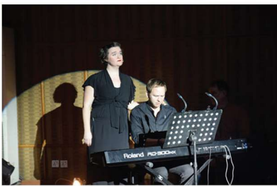
The Broadway Bridges performing at UCP Auditorium