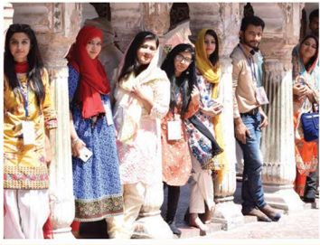
UCP Students posing at Masjid Wazir Khan

UCP Photography Club in collaboration with the Walled City of Lahore Authority organized a photo walk for the UCP students. The walk commenced from Mochi Gate and the route included Mohalla Shayan, Mubarak Haveli, Haveli Wajid Ali Shah, Wazir Khan Mosque, Tezabiyan Bazar, Waan Market, Surjan Singh Chowk, Pani wala Talab, and Laangay Mandi. The Walk aimed at promoting the tourism and historical importance of Lahore through the lens of Camera.