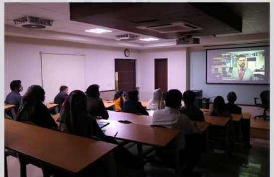
A video session on Communication Accommodation Theory, held at FMCS in November 2020