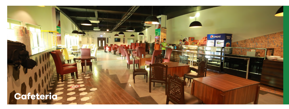
Variety of food options with comfortable ambiance