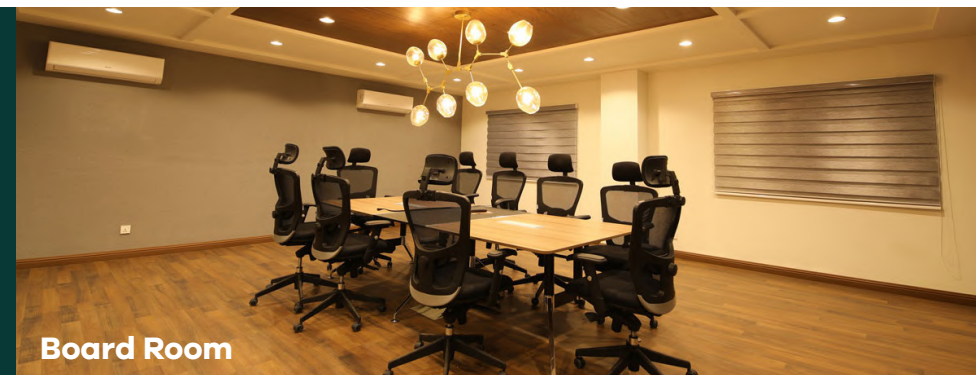
For meetings and brainstorming sessions