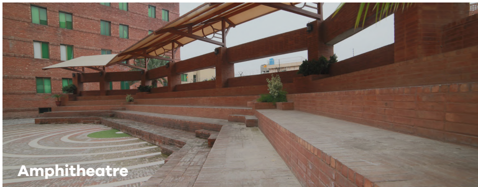
Training ground for our young performers