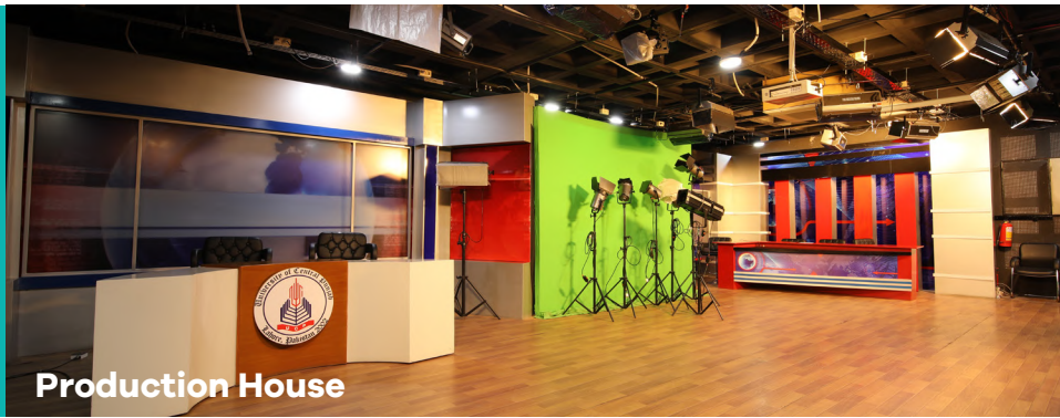
Bringing scripts and ideas to life