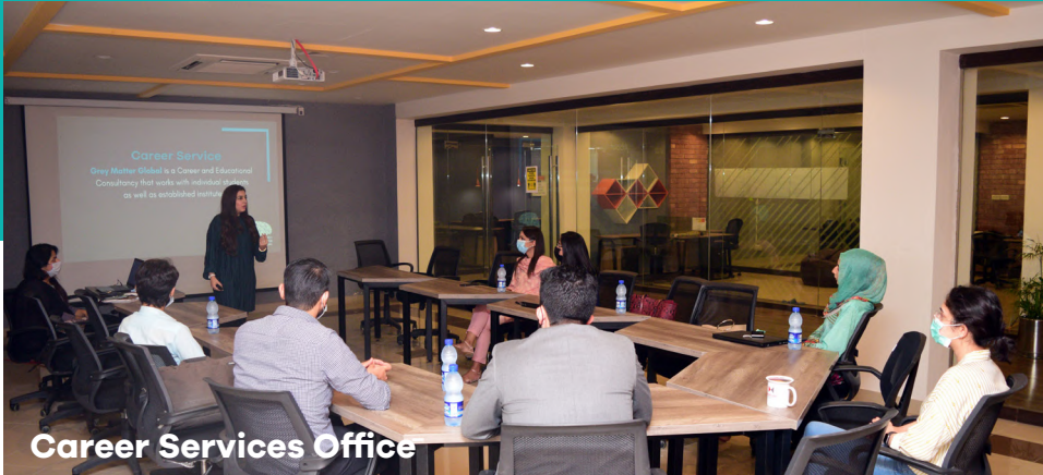
Career Services Office