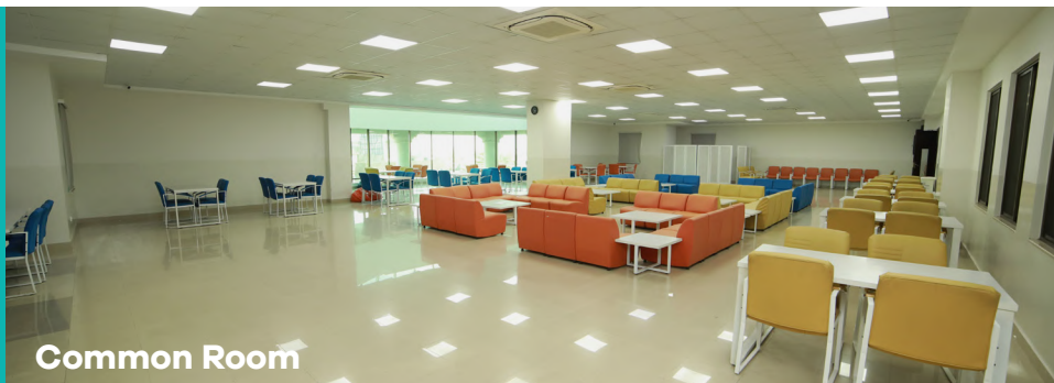
A shared lounge for students