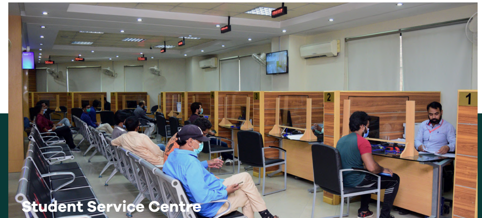
Student Service Centre