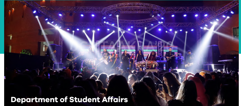
Department of Student Affairs