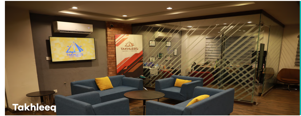
In-house business incubator