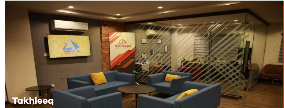
In-house business incubator