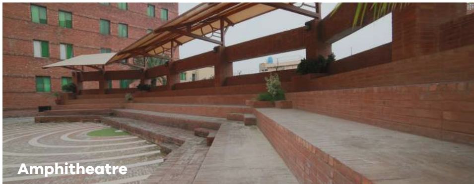
Training ground for our young performers