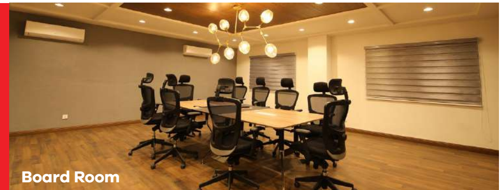
For meetings and brainstorming sessions