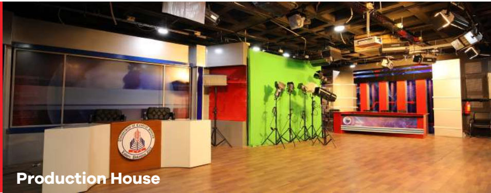
Bringing scripts and ideas to life