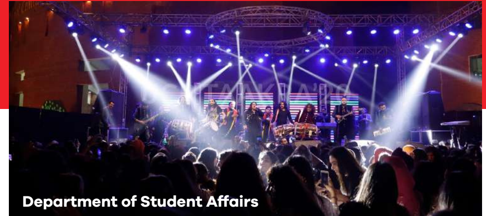
Department of Student Affairs