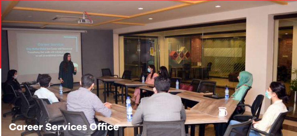
Career Services Office