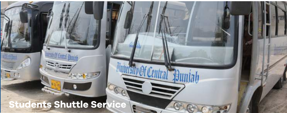
Students Shuttle Service