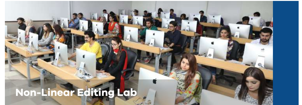
Non-Linear Editing Lab

Equipped with specialised computers to yield meticulous results while working on post-production