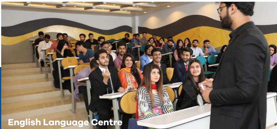
English Language Centre