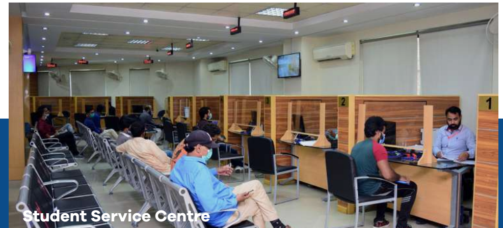
Student Service Centre