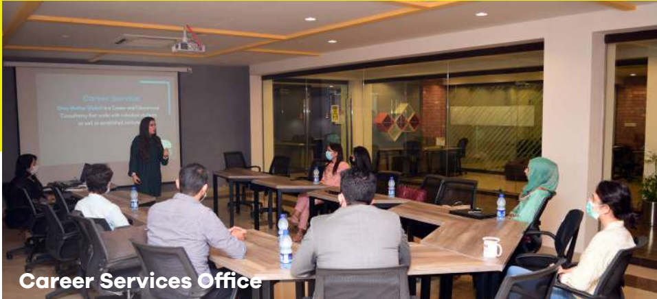
Career Services Office