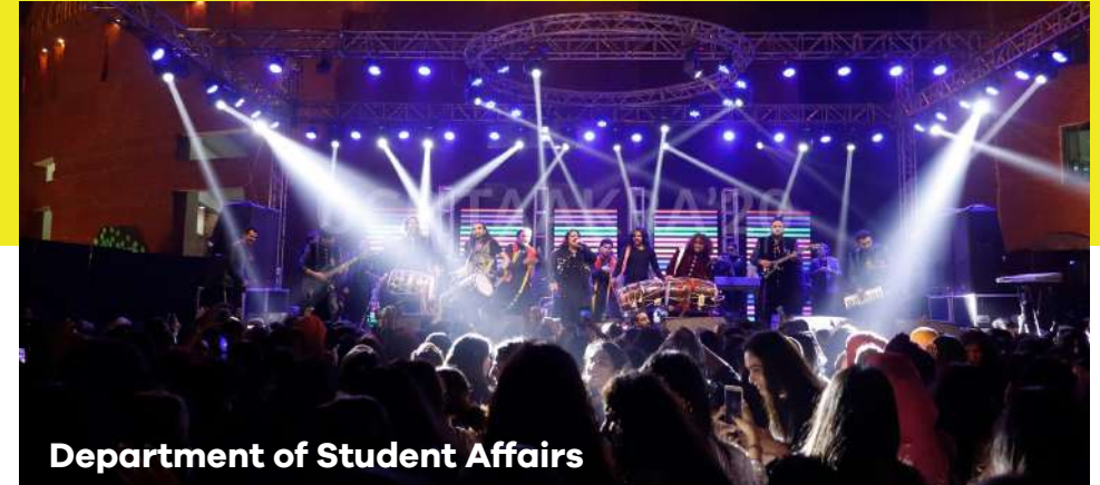
Department of Student Affairs