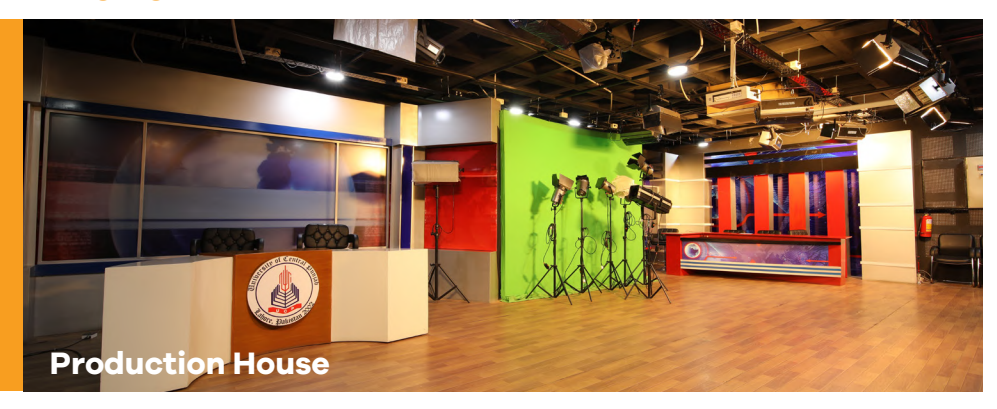
Training ground for our young performers